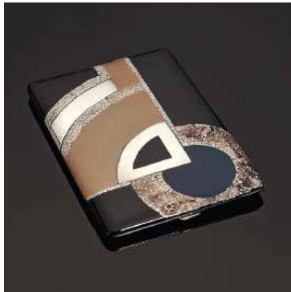
Cigarette case by Cartier, France, c.1925.

The crash of 1929 affected all levels of society, and proved catastrophic to the luxury industries in particular. From 1930 onwards, as the economic devastation deepened, clients stopped buying as many extravagant items, and firms stopped producing anything they thought might prove difficult to sell. Indicative of the change in consumer preferences, Cartier's flagship stores in both London and New York recorded a 50 per cent fall in sales of the more expensive and exclusive items such as cigarette and vanity cases created using precious materials, but an equivalent rise in sales of the more affordable and practical items such as